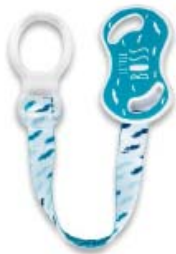
Sea Green Cool